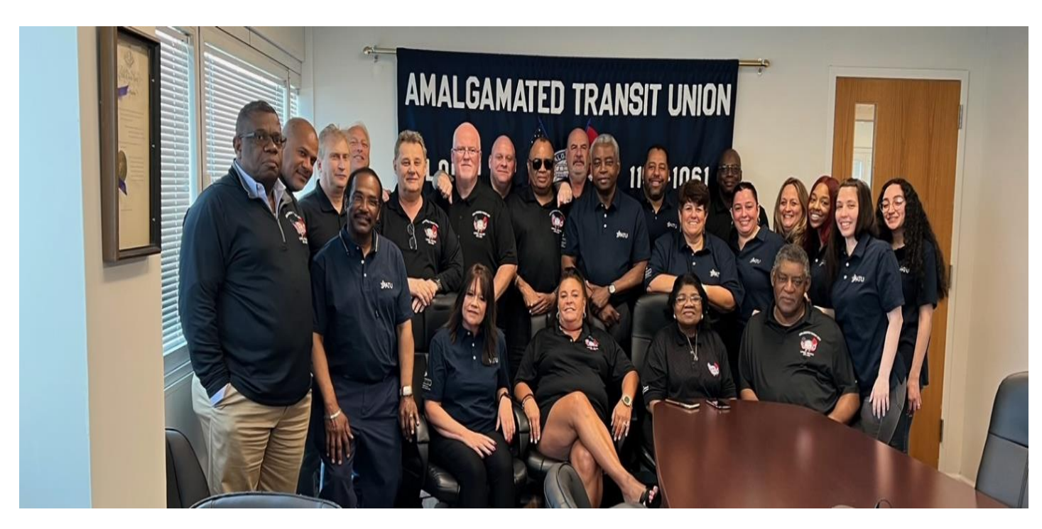
ATU\ Local\ 1181\text{-}1061\ Executive\ Officers, Executive\ Board\ members, LI\ field\ Reps\ and\ Office\ Staff