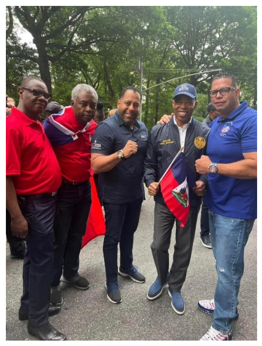
Mayor Adams in the house!